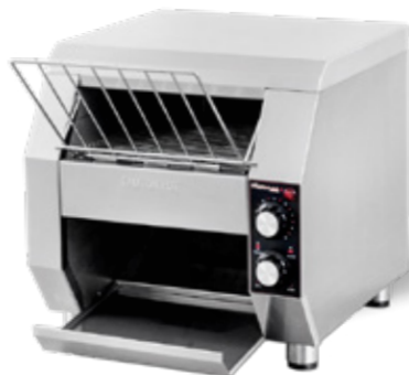
TT-1 / TT-1H / TT-1HL