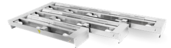
OFW-24L / OFW-36L / OFW-48L