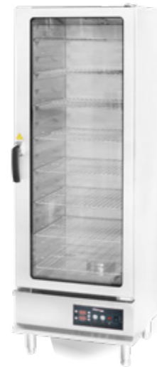
FW1-155 / FW1-155A FW1-176 / FW1-176A