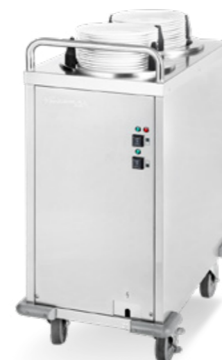
PD2-730 / PD2-920