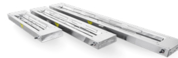
OFW-24 / OFW-36 / OFW-48