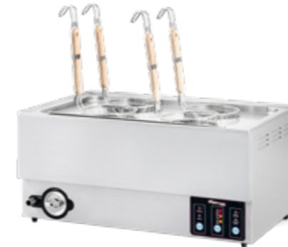
BM-5737ESD + BM-103