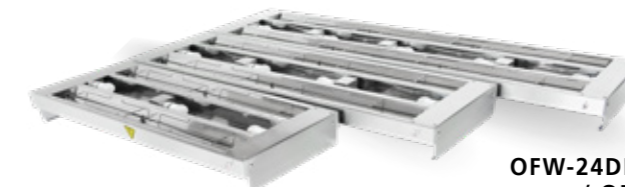
OFW-24DL / OFW-36DL / OFW-48DL