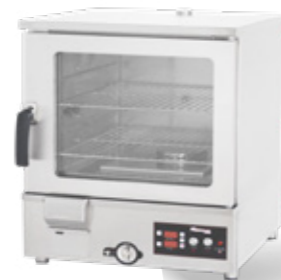
FW1-081 / FW1-081A