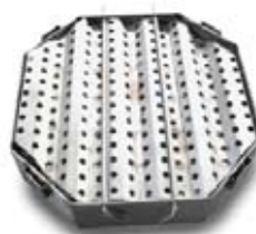
Heat radiant panel