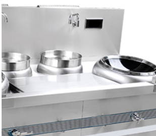
電磁矮湯爐 Induction Stock Pot