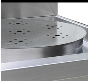
燃氣/電熱蒸櫃 Gas/Electric Steam cabinet