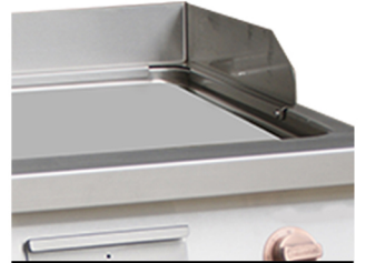
燃氣平頭爐 Gas Range