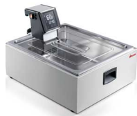
Optionals s/steel container with lid 2/1 GN