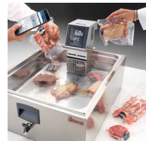
Optionals s/steel container with tap and lid 2/1 GN