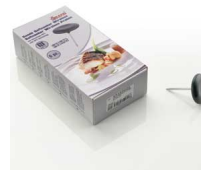
Optional set 6 wireless probe NFC