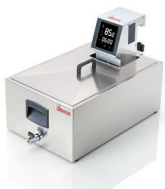
Optionals s/steel container with tap and lid 1/1 GN