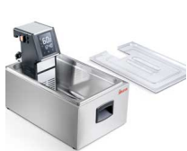
Optionals s/steel container with lid 1/1 GN