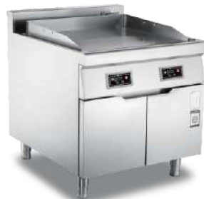
900mm Electric Griddle