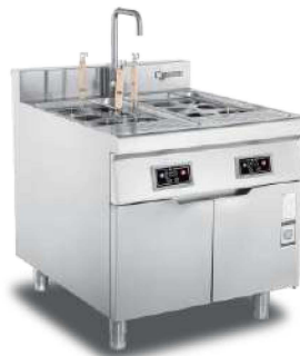
900mm Electric Noodles Cooker