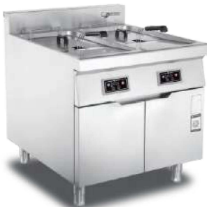
900mm Electric Dual Tank Fryer