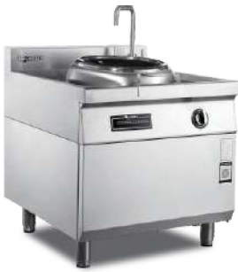
900mm Induction Wok