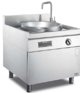
900mm 600 Induction Cauldron