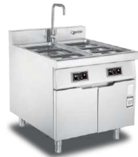
900mm Electric Bain Marie