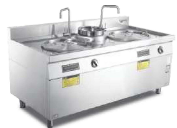
900mm Dual Tank Noodles Cooker