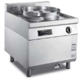
900mm Induction Dim-Sum Steamer