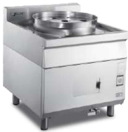
900mm Electric Dim-Sum Steamer